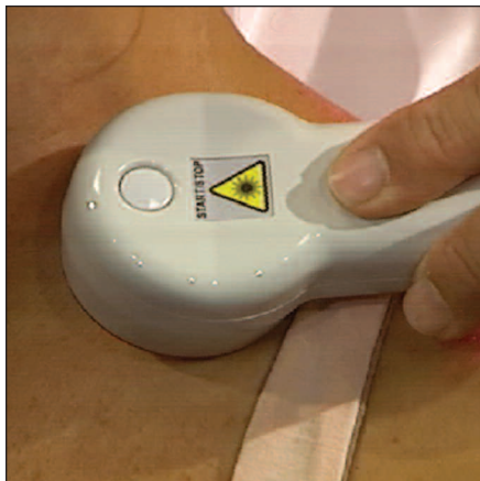
FIGURE 4. Photobiostimulation of the scalene lymphatic channels.