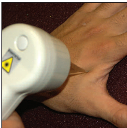
FIGURE 5. Laser Acupoint Stimulation of LI4.

ter in small circular motions over the treatment site (see Figure 4). This will aid in optimizing the tertiary effects mentioned above. Lymphatic photobiostimulation is usually applied over the scalene nodes. Treating over the thoracic and/or lymphatic ducts are also common sites of laser biostimulation.