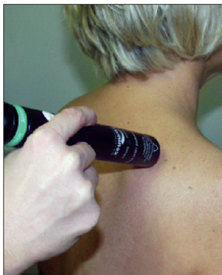
FIGURE 3. GaAlAs single diode laser probe applied to right neck and shoulder.